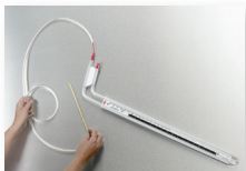
1227 mounted in incline position